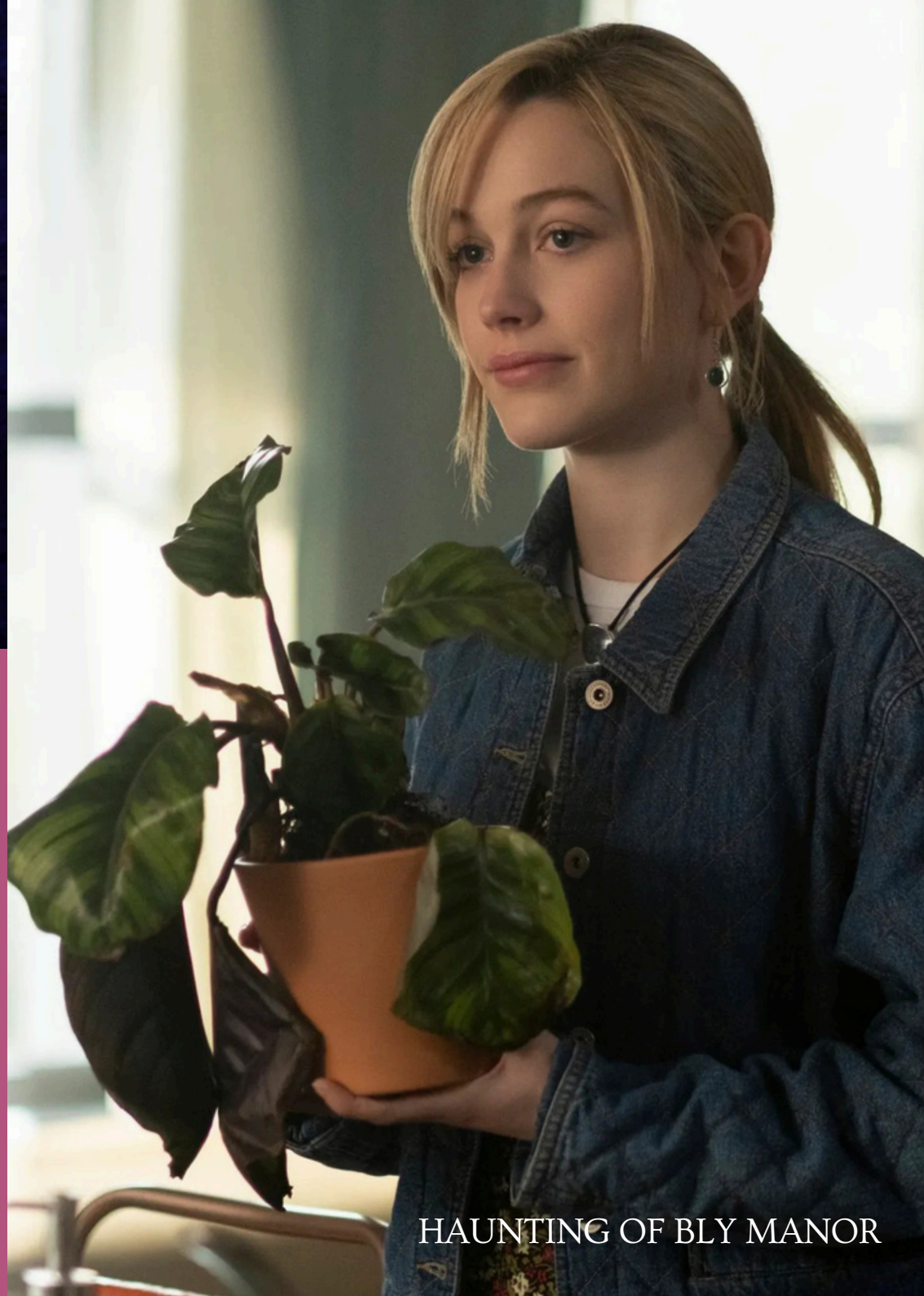
HAUNTING OF BLY MANOR