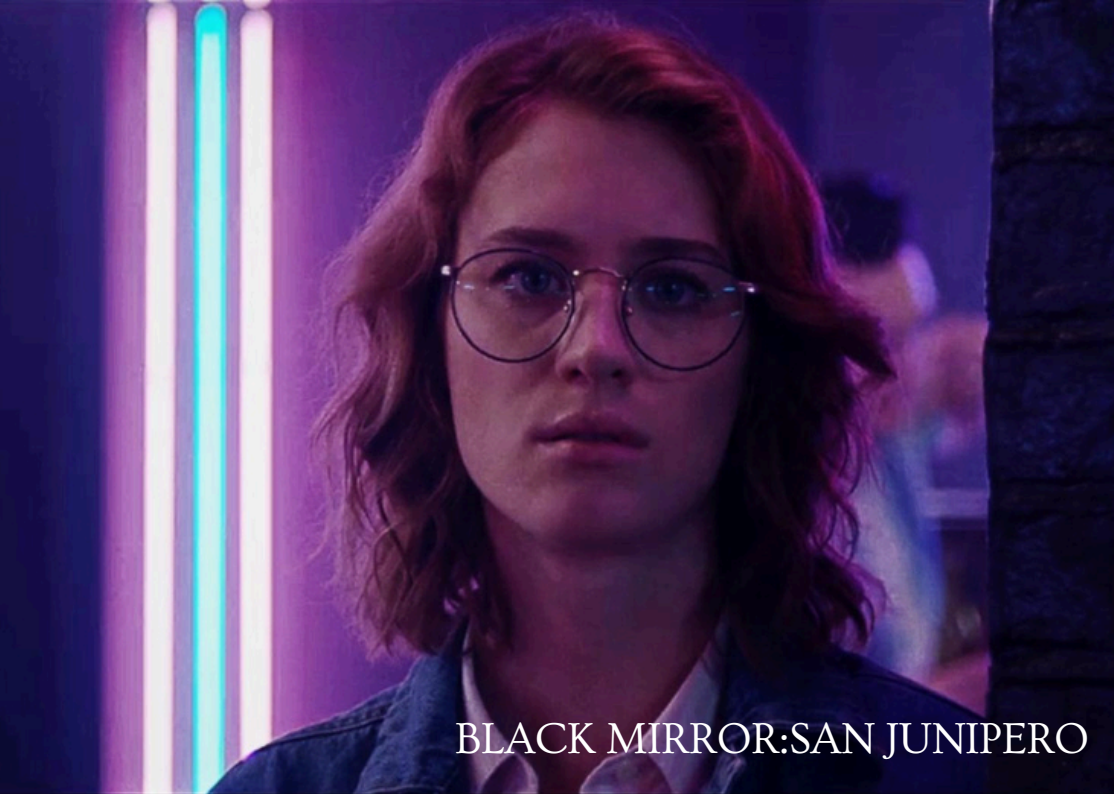
BLACK MIRROR:SAN JUNIPERO