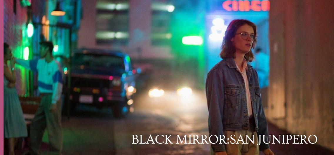
BLACK MIRROR: SAN JUNIPERO

Mirroring the polarity of Zoe and Karrie, the palette splits the film into two distinct worlds. The everyday shines a little too safe in soft pinks and warm pastels, creating a cozy glow reminiscent of nostalgic rom-coms like Legally Blonde and Bridget Jones's Diary . Flipping the narrative, flickering neon lights and pockets of darkness introduce a neo-noir edge that reveals the truths the rom-com gloss tries to hide. The shadows and underlying grit are always there, hidden beneath the surface in a manner similar to the Black Mirror episode "San Junipero," suggesting that nothing is quite as it seems. It is a visual tug-of-war where the secrets we keep constantly threaten to bleed through our perfectly manicured world.